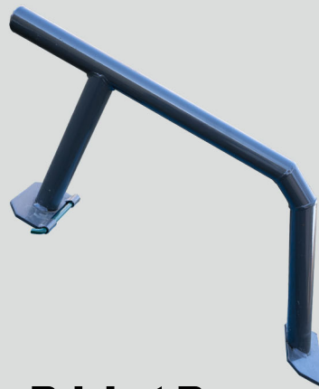
Brisket Bar Weight 24 lbs