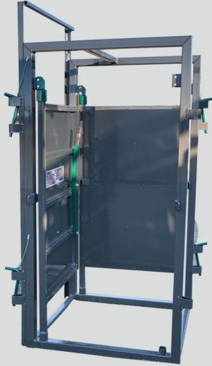
Palapation Cage Unit Specifications

Built to Handle the Largest to Smallest Animals with Quick, Easy Motion