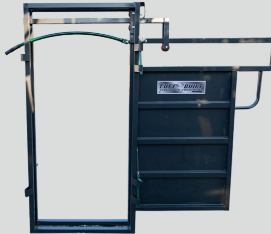
Alley Gate Slider Weight 145 lbs

Overall Length 97" Overall Width 29.5" Weight 130 lbs